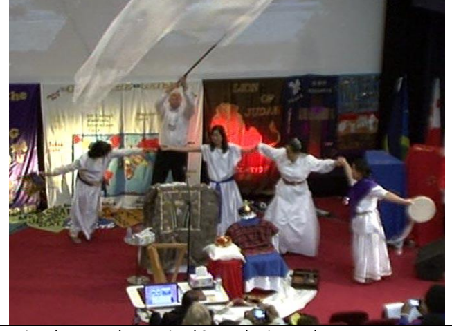
Asian dancers who received 2 prophetic words