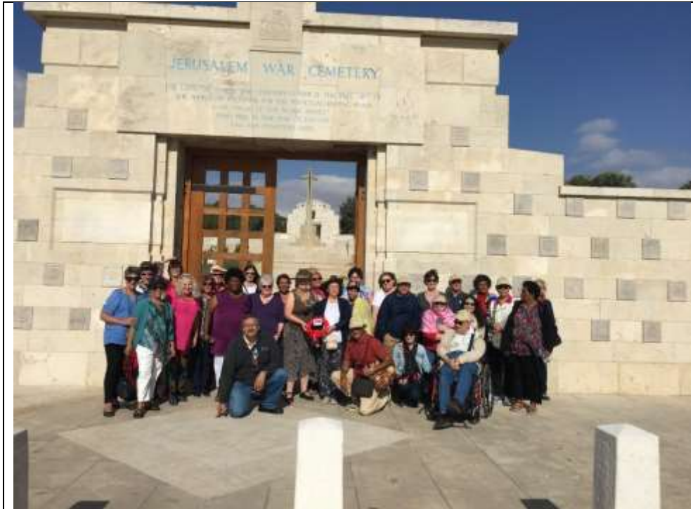
Some of our group Jerusalem War Cemetery Mt Scopus ready to lay a wreath after prayers