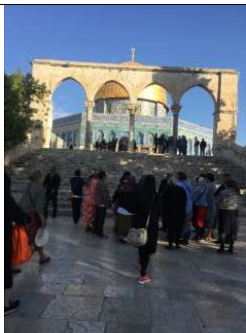
Praying quietly at Temple Mount