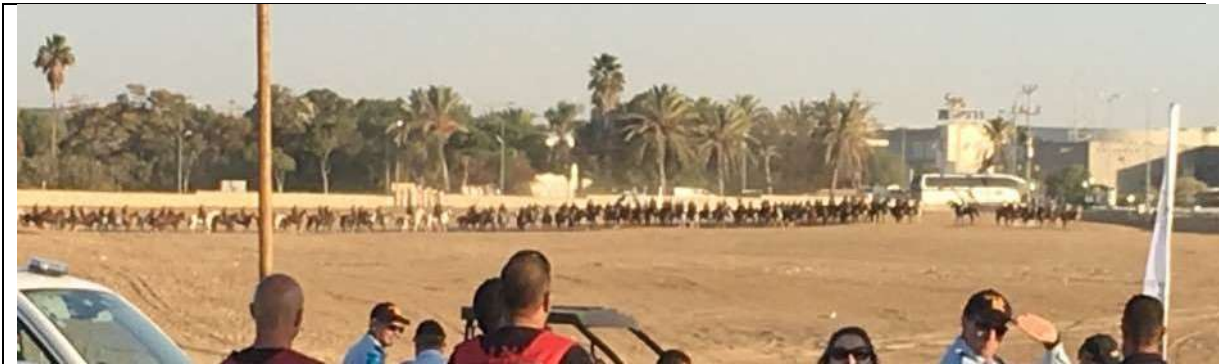
Lighthorse charge re-enactment Beer Sheva 31.10.2017