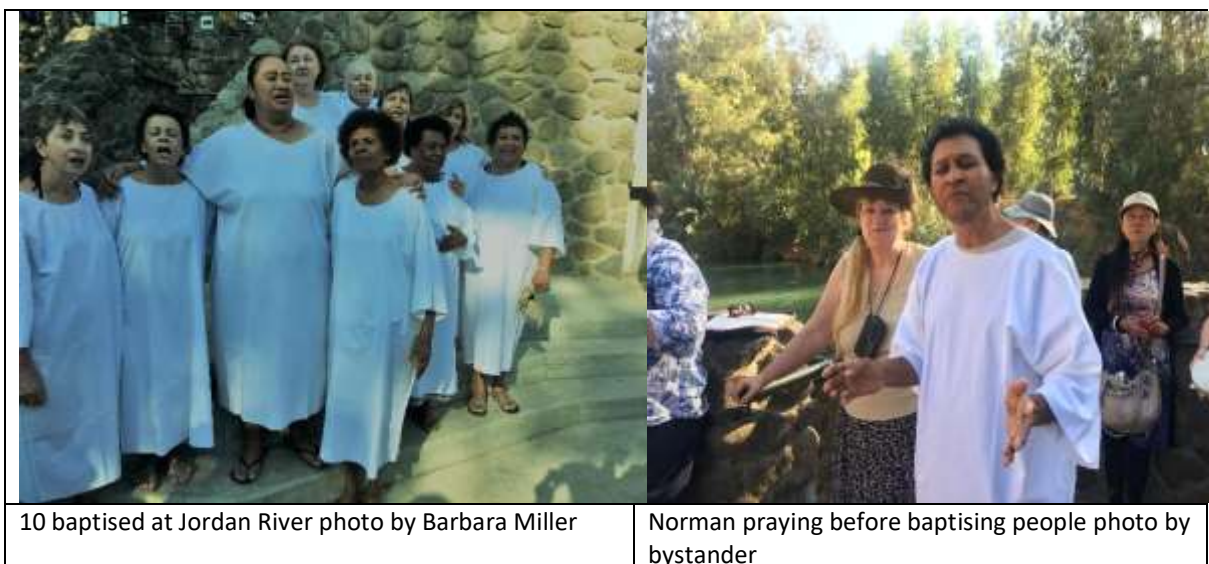
10 baptised at Jordan River