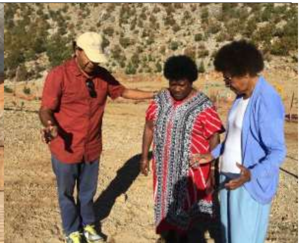
Abraham's Gate Tel Dan