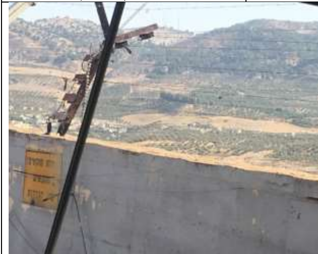
Hamat Junction where we prayed on Israel's border with Syria & Lebanon