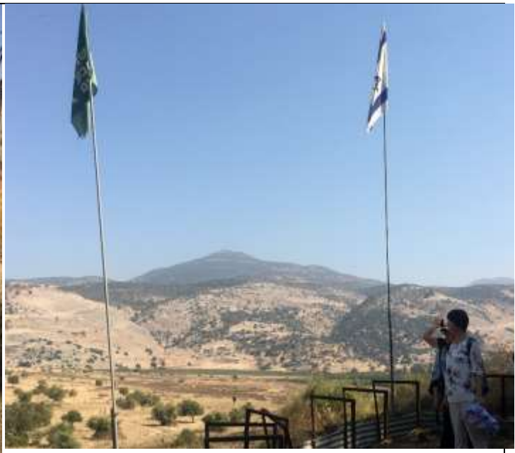
Praying on border with Lebanon