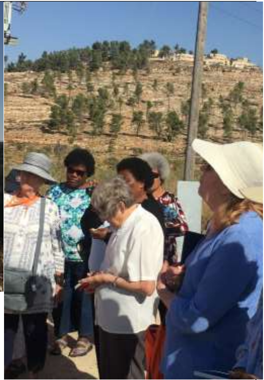
Prayer at Beth El