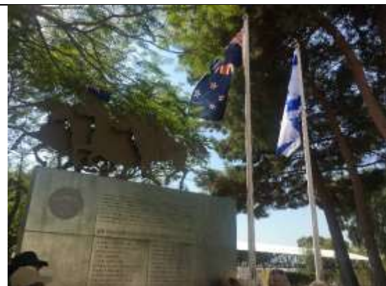
Statute to NZ mounted Rifles at Ness Ziona