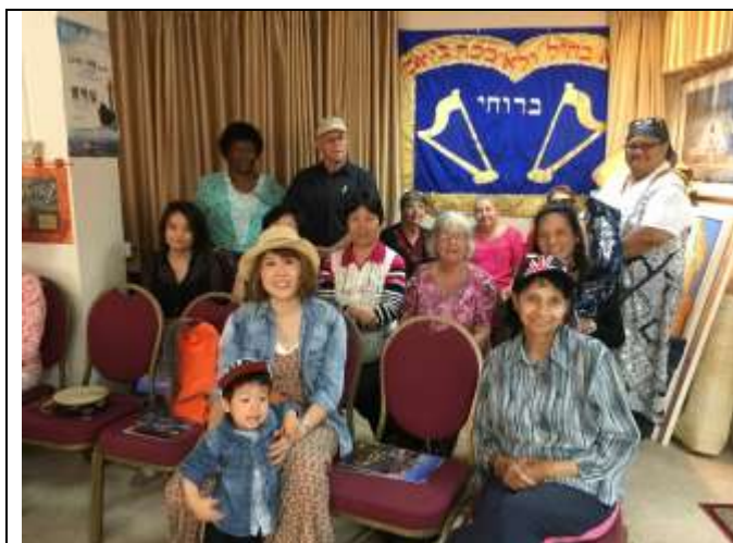
Tel Aviv Prayer Tower some of our group