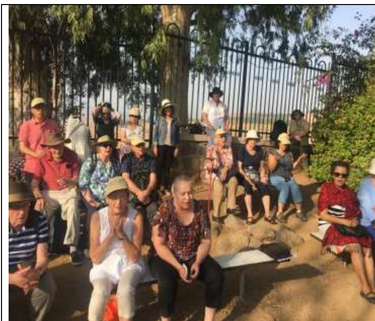
Prayer at Mt of Beatitudes