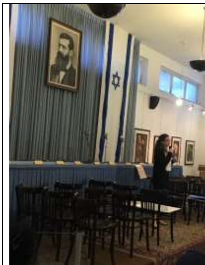
Independence Hall Tel Aviv

I found visiting Independence Hall in Tel Aviv was an emotional experience for me as much of the tour was but I was particularly teary here as there was a re-enactment of sorts by photos and sound recordings of the declaration of the state of Israel and the playing of the national anthem.