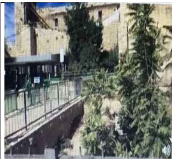
Hebron Tomb of the Patriarchs