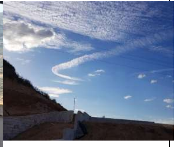
Unusual cloud formations at Sderot as we prayed on border with Gaza