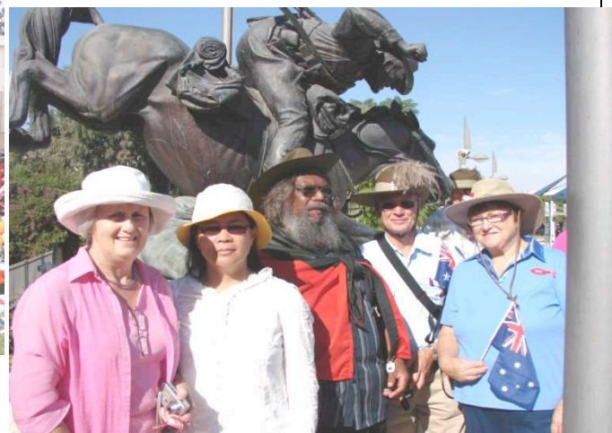
Australians at Park of the Australian Soldier, Be'er-Sheva, donated by Pratt Foundation, Australia. We laid wreaths there also.